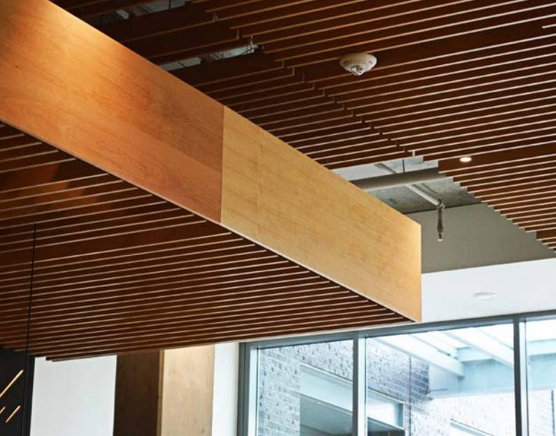
The wood grille ceiling has solid, clear Western Hemlock wood members with flat grain on the primary faces and vertical grain on the secondary faces. Matching fascia trims are veneer on fire-rated substrate.