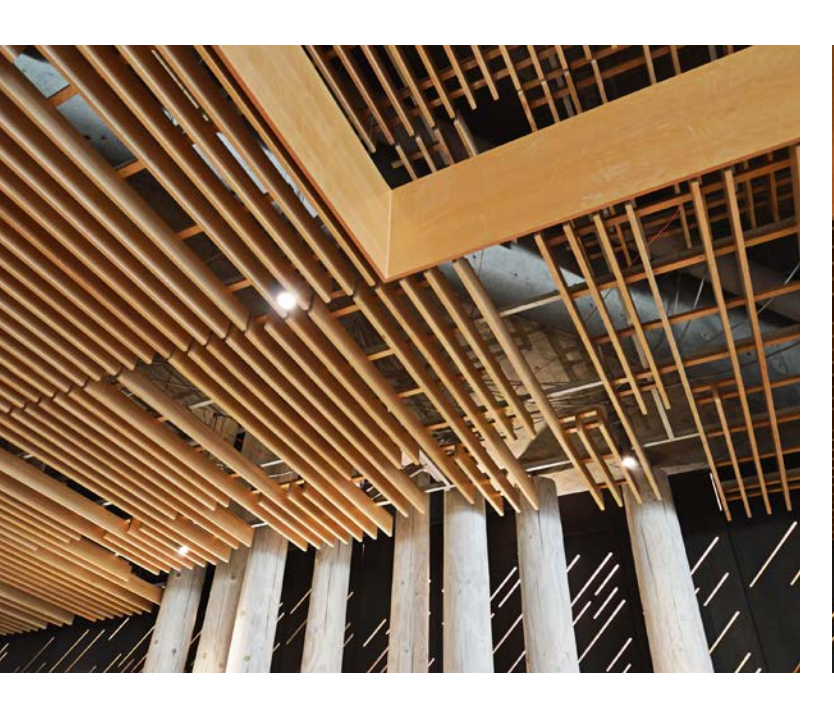
"The manufacturer created a ceiling that looks site built, but it's panelized," the manufacturer's rep said. "It allowed the acoustical subcontractor to function like a finished millworker."

"Every two days, we'd micro-schedule the sequences of where everyone would work," said