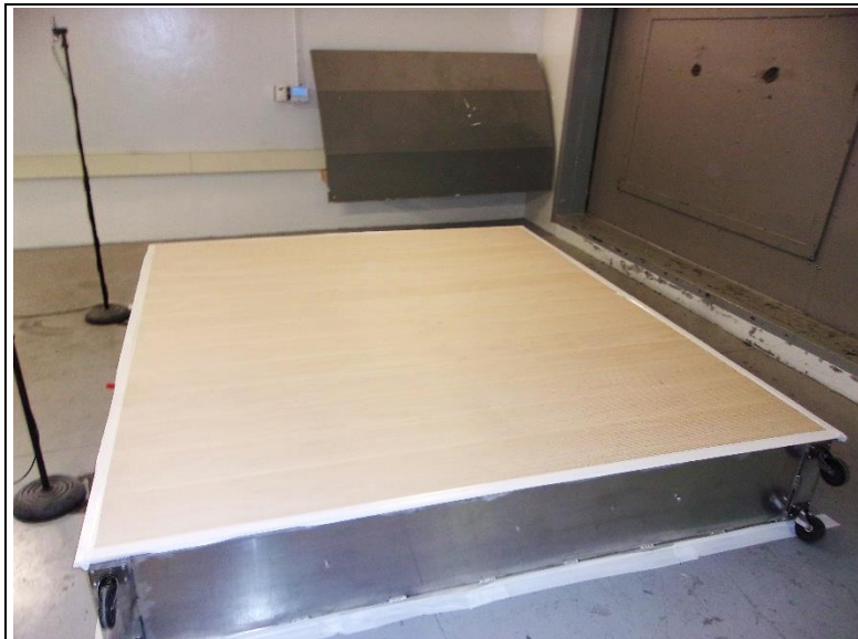
Photo No. 1 View of Test Specimen