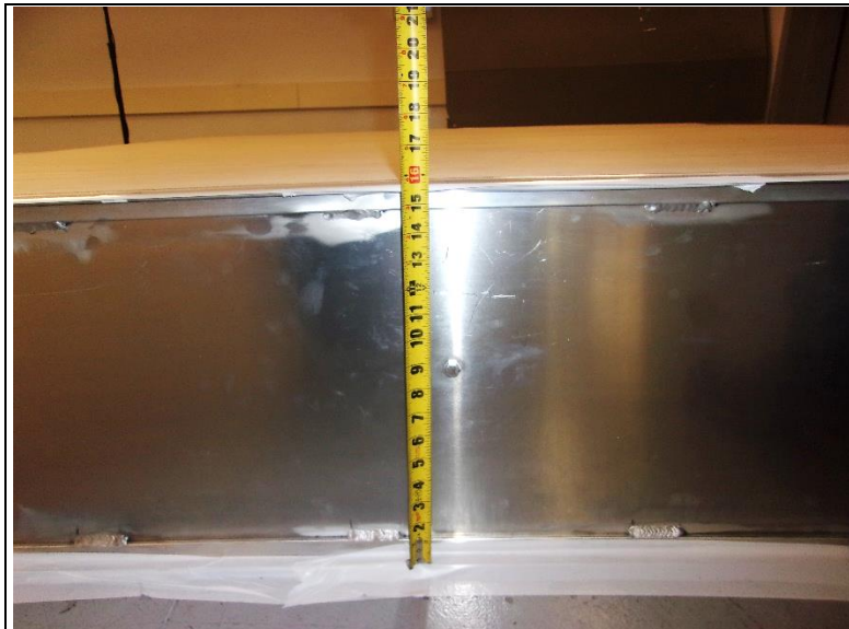
Photo No. 2 Cross Section View of Test Specimen